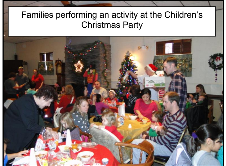
Families performing an activity at the Children's Christmas Party