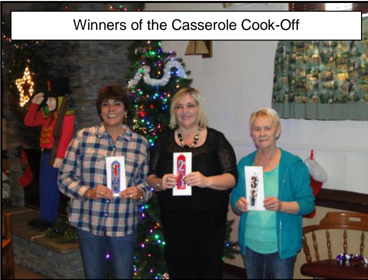
Winners of the Casserole Cook-Off