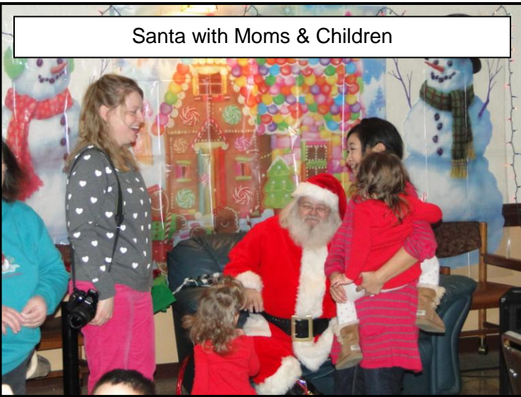
Santa with Moms & Children